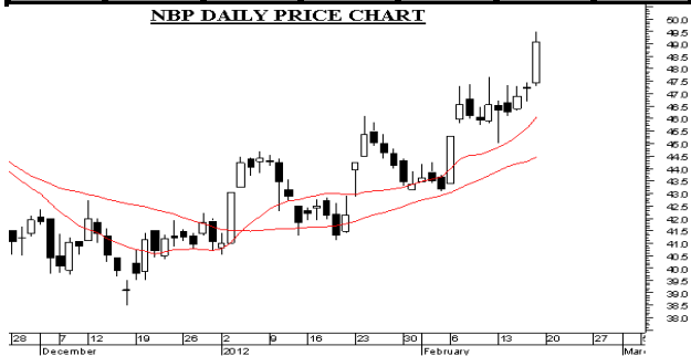
NBP DAILY PRICE CHART