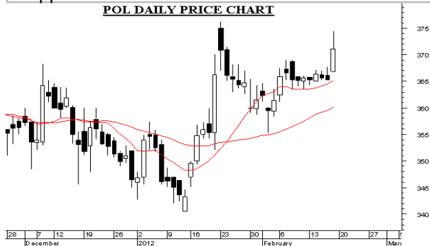
POL DAILY PRICE CHART

The resistance level of NBP is at Rs. 50 and support level at Rs. 48.